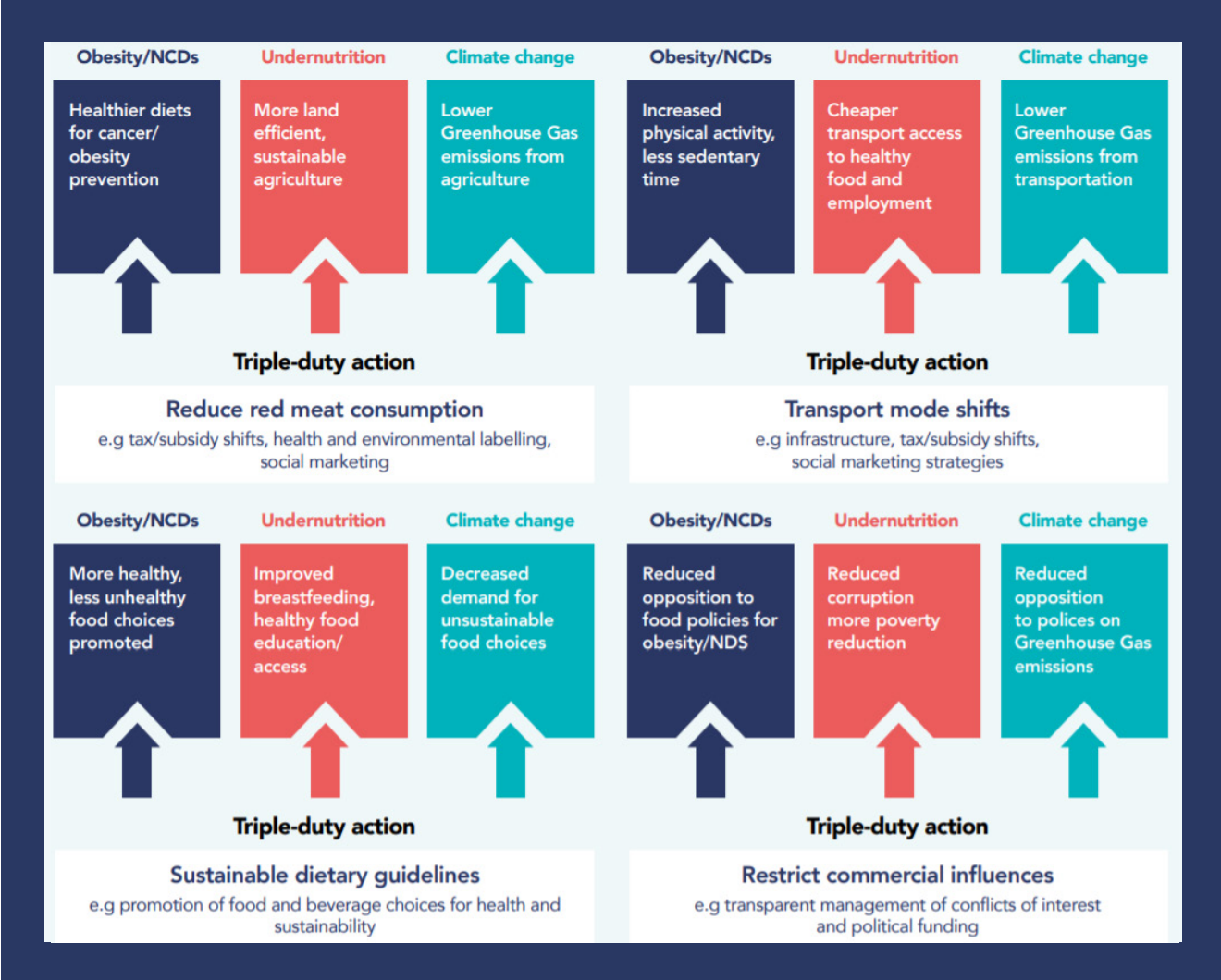
Figure 4. Examples of triple-win policies that can help redesign food systems to end all forms of malnutrition.

Many of our global problems are interconnected. Addressing obesity can also have positive impacts on other issues. Obesity, undernutrition and climate change share common drivers, for example, food systems not only drive the obesity and undernutrition pandemics but also generate 25-30% of GHGs, and cattle production accounts for over half of those. Underpinning these issues are weak political governance systems, the unchallenged economic pursuit of GDP growth, and the powerful commercial engineering of overconsumption. Adopting double- and triple-duty actions can help address the common drivers simultaneously through whole-of-government and whole-of-society interventions. Actions need to focus on common causes and solutions, and encourage work across different sectors of society. Figure 4 presents a number of examples of triple duty actions.